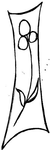
This is the original Cherry Home Association Logo

CHA has an architectural Committee that helps new owners/builders understand the deed restrictions of Cherry Home Subdivision. These people are also well versed in the local zoning ordinances. If you are planning to build please submit your plans to them. One important restriction to bear in mind is the "DO NOT CLEAR CUT" you lot in preparing to build. Trees are to be preserved to maintain the aesthetically natural surrounding that brought you to this locale.