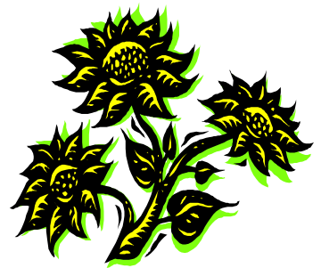
Sunflowers Grow a plant and feed the birds.

Your board has looked at ideas to renovate the clubhouse with nothing close to a plan yet. A lot of member input will be sought before we go much further. We spent a significant amount of time and worry about the encroachment issue (reported elsewhere). With the discussion in the Northport village about the waste treatment system many questions arose about CHA and our potential interest in their system or a similar activity. I created a CHA waste treatment inventory from County Health Department records and will have that available at the annual meeting and on the web site.